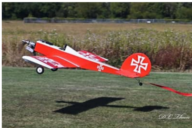
. . . and another giant Stick.