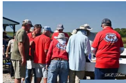
Pilots scoring swag