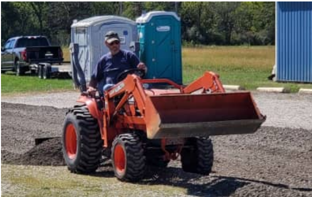
Kent grading. The parking lot hasn't looked this good since it was first installed several decades ago!