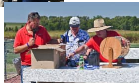
And the raffle winner is . . .