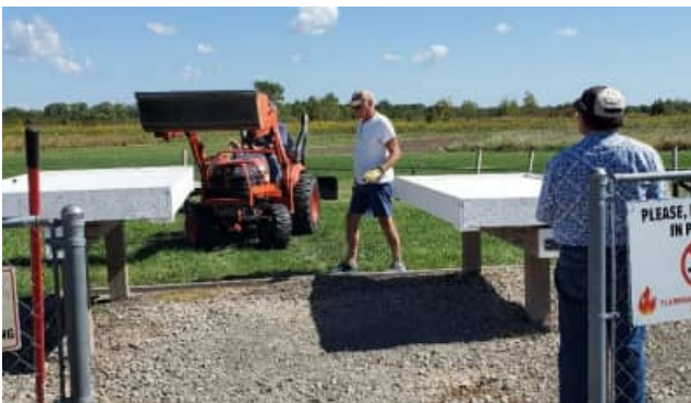
Some of the gravel went under the work tables, badly needed!