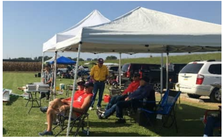
Some of the dozen or so JMM folks at the fly-in

My little ol' Icon A5 doesn't seem to care whether it's water or grass, takes off just fine