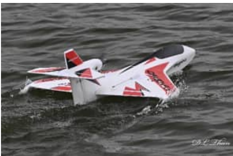
Glenn Minor's Dragonfly flies great with a new, more powerful motor