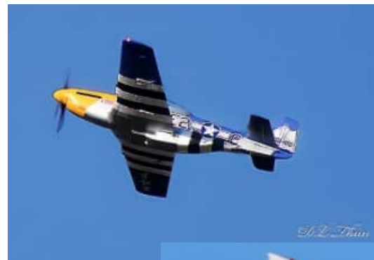
Last photo of the P-51 on its 13 th and final flight

Kent Kummar readies his 4-Star 60 for flight