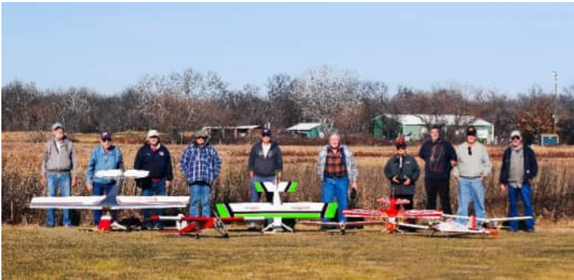
Christmas week pilots