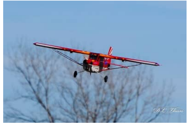
BC's Decathalon on final