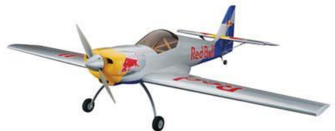
January Raffle Plane

Winter is upon us, with the thermometer hovering at 8 o F. at midday. Although the last two months have been unseasonably warm and dry, they have also been quite windy, limiting flying time.