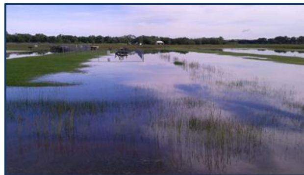
View north from the entry road.