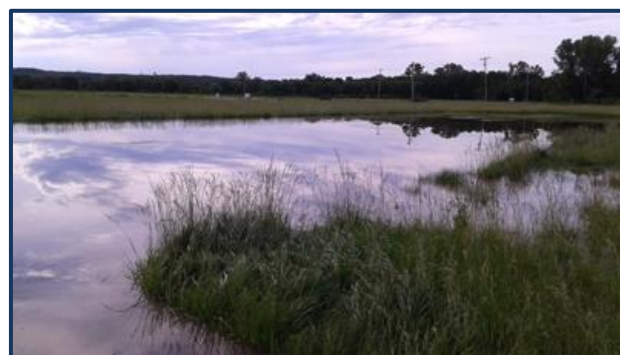
The south end of the N/S runway.