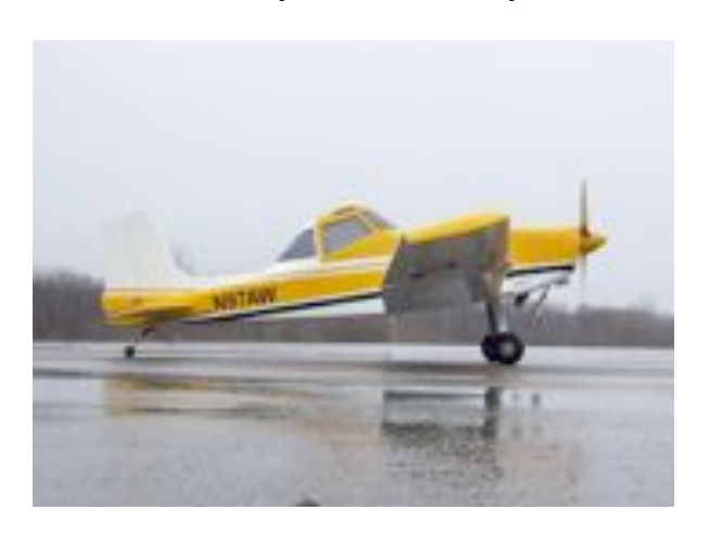
10 Years ago, The Model Masters

The JHMM Board is contemplating offering a large 97" Cessna 188 AG Wagon for one of the future events as a raffle prize. Start hoarding your money now for this baby. $439 RC Guys ARF.