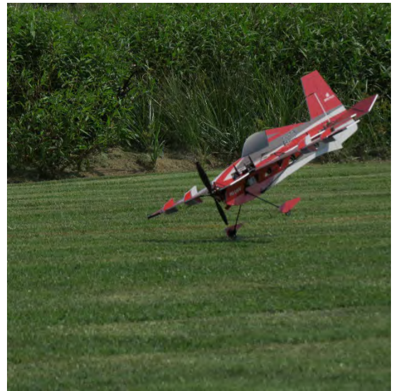
One wheel counts too!