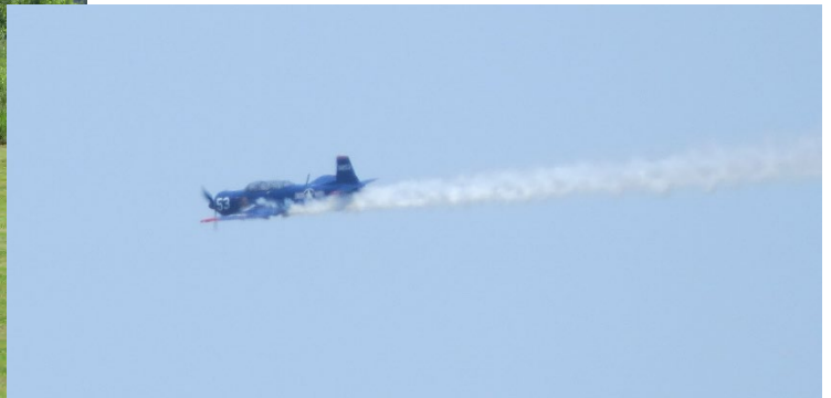
Bob Dole 100 th Birthday Flyover