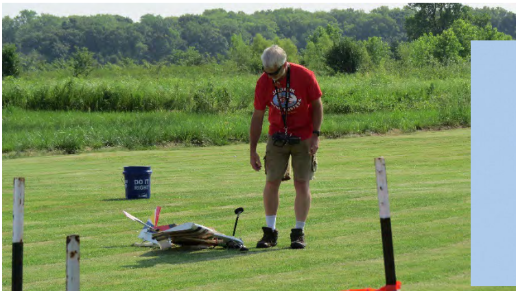
Watch the plane not the golf ball!