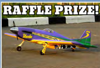
Nexa P-51 Mustang Voodoo

Pilot Registration 8:00a. Landing Fee $10 Flight Time 9:00a to 4:00p.