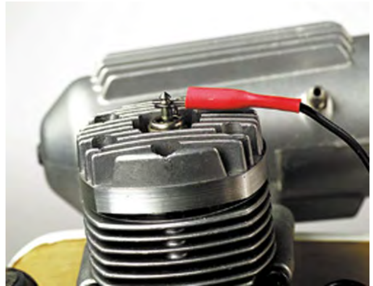
DU-BRO Remote Safety Ignitor clip

The DU-BRO glow plug clip shown below connects to your glow plug stem just like the Hanger 9 boot. I ran this on an OS 46 for several flights and saw no heat damage to the red shrink wrap.